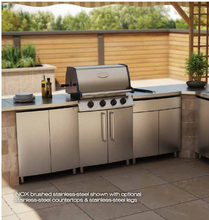
INOX brushed stainless-steel shown with optional stainless-steel countertops & stainless-steel legs