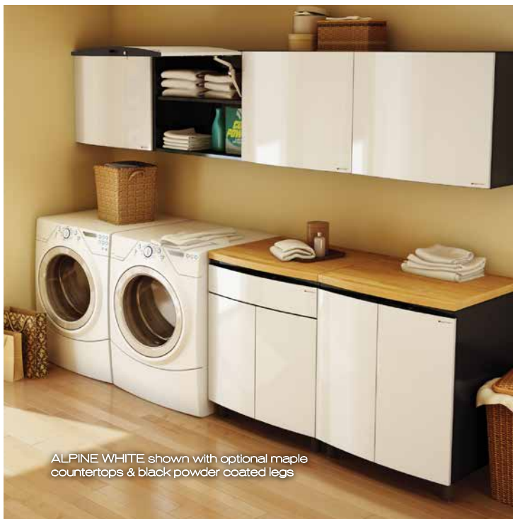
ALPINE WHITE shown with optional maple countertops & black powder coated legs