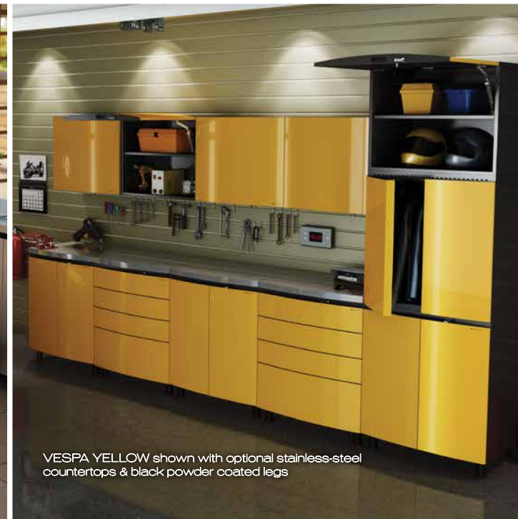
VESPA YELLOW shown with optional stainless-steel countertops & black powder coated legs