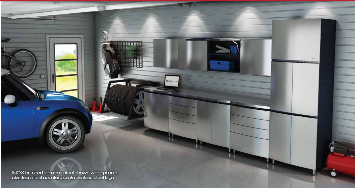
INOX brushed stainless-steel shown with optional stainless-steel countertops & stainless-steel legs